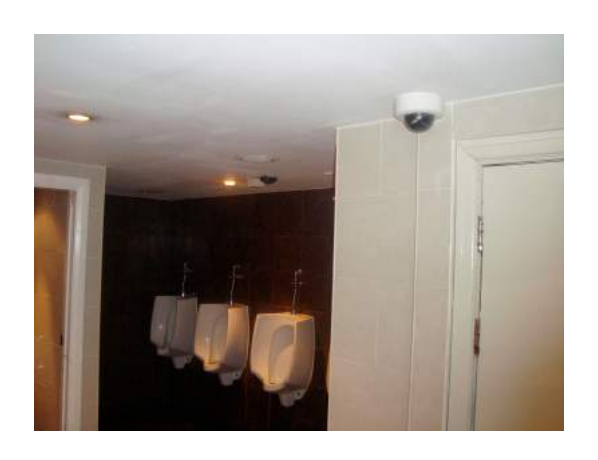
Pic. 2 – CCTV cameras inside men's washroom over urinals

These open-street CCTV signs indicated a purpose and identified who was operating the system, but the diminutive text was difficult to see. It is doubtful these signs are readable by vehicle drivers or pedestrians who would be subject to surveillance, and therefore whether the legal duty of notification has been successfully discharged. It is possible to identify other examples where, presence and content of signage aside, contextual issues (such as those relating to the purpose or positioning of the cameras or signs) throw the legality of the system into doubt and undermine the level of trust the system earns. Examples include a camera in a pub positioned inside the men's rest-room and a council-run open-street camera pointed straight into a block of apartments.