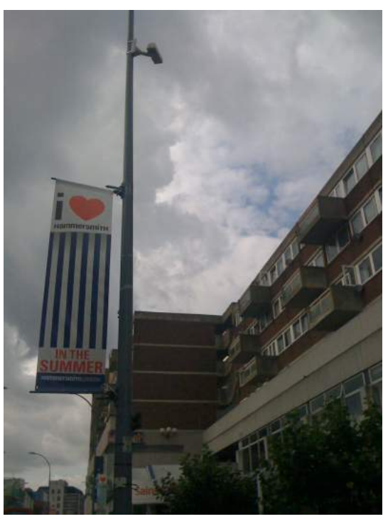
Pic. 3 – CCTV camera focused into private residence