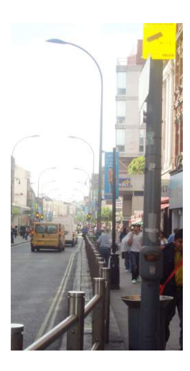
Pic. 1 – Open-street CCTV and traffic sign difficult to read from vehicle or pedestrian sidewalk.