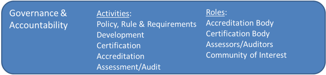
Figure 6. Governance Layer

The layer at which entities create, monitor, and enforce rules, guidelines, and requirements for executing the IDESG functional elements across communities or actors. Unlike the administration and operations layer, the governance and accountability layer is specifically intended to address cross entity efforts rather than enterprise or internal governance.