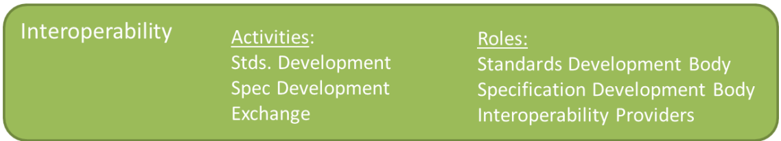
Figure 5. Interoperability Layer

The interoperability layer is that at which entities in the ecosystem establish and maintain the ability to communicate and exchange identity data