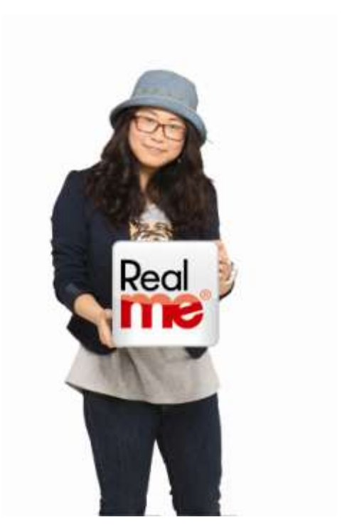
CROWN COPYRIGHT ©

This work is licensed under the Creative Commons Attribution 3.0 New Zealand licence. In essence, you are free to copy, distribute and adapt the work, as long as you attribute the work to the Crown and abide by the other licence terms. Visit http://creativecommons.org/licenses/by/3.0/nz/.